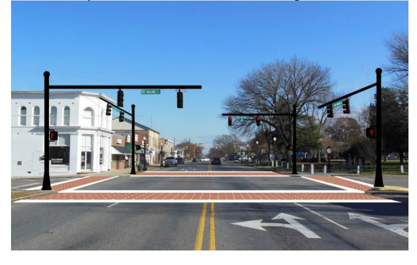
Illustration showing new signal poles and mast arms, and brick-pattern crosswalks. Note: black signal housings are used.